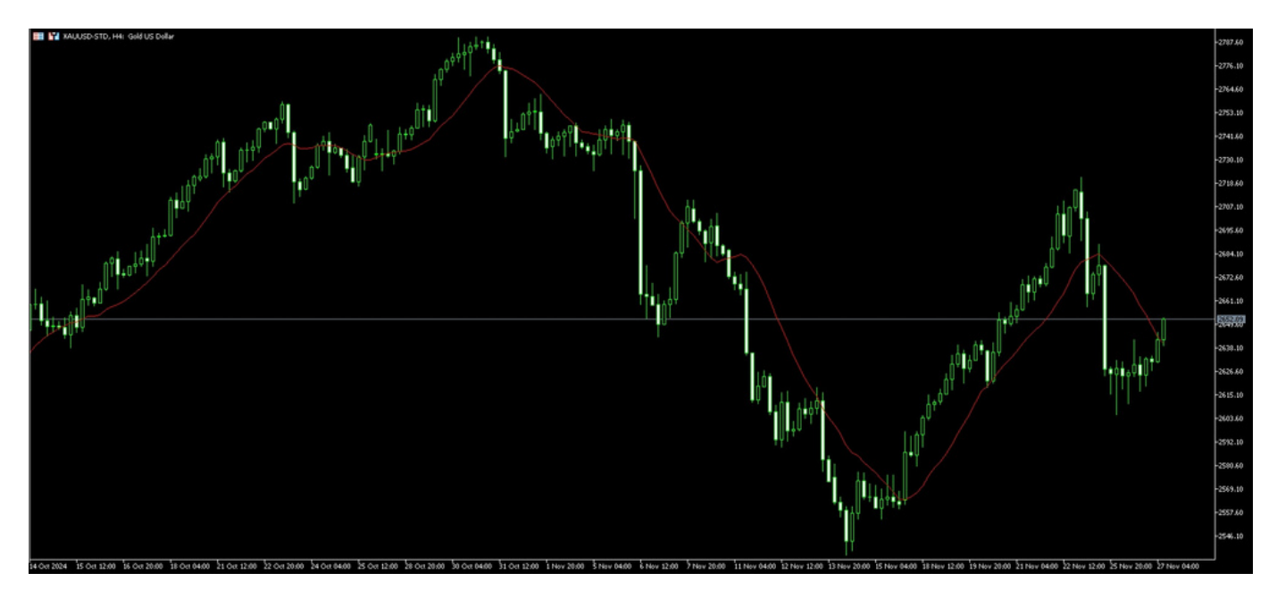
Figure 3: 4-Hour Chart of Gold showing recent correction after U.S. Presidential Elections

With that said, Gold fell about 9 % from its highs at $2790/oz just before the election result to find support around the $2540/oz area, and certainly in the short-term we could see more downward pressure on Gold, especially if the FED slows down its forecasts for future rate cuts.