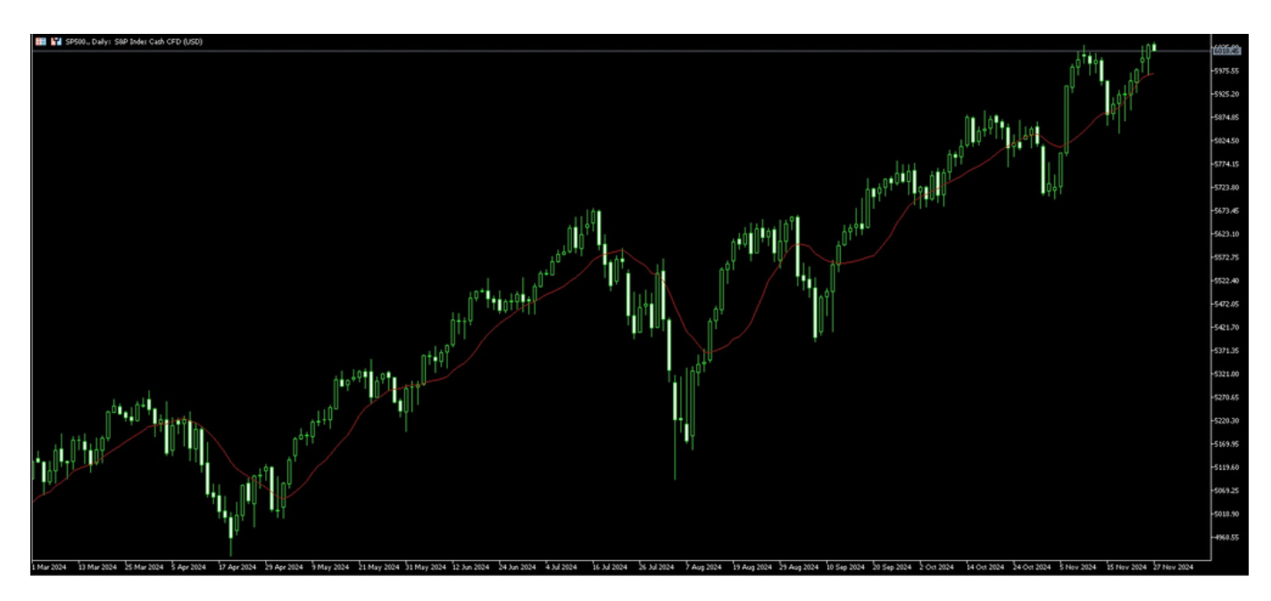
Figure 2: S&P500 Daily Chart

As the year ends, institutional investors may rebalance their portfolios, potentially causing unusual market movements. So we could expect higher trading volumes and sector rotation as funds adjust exposures.