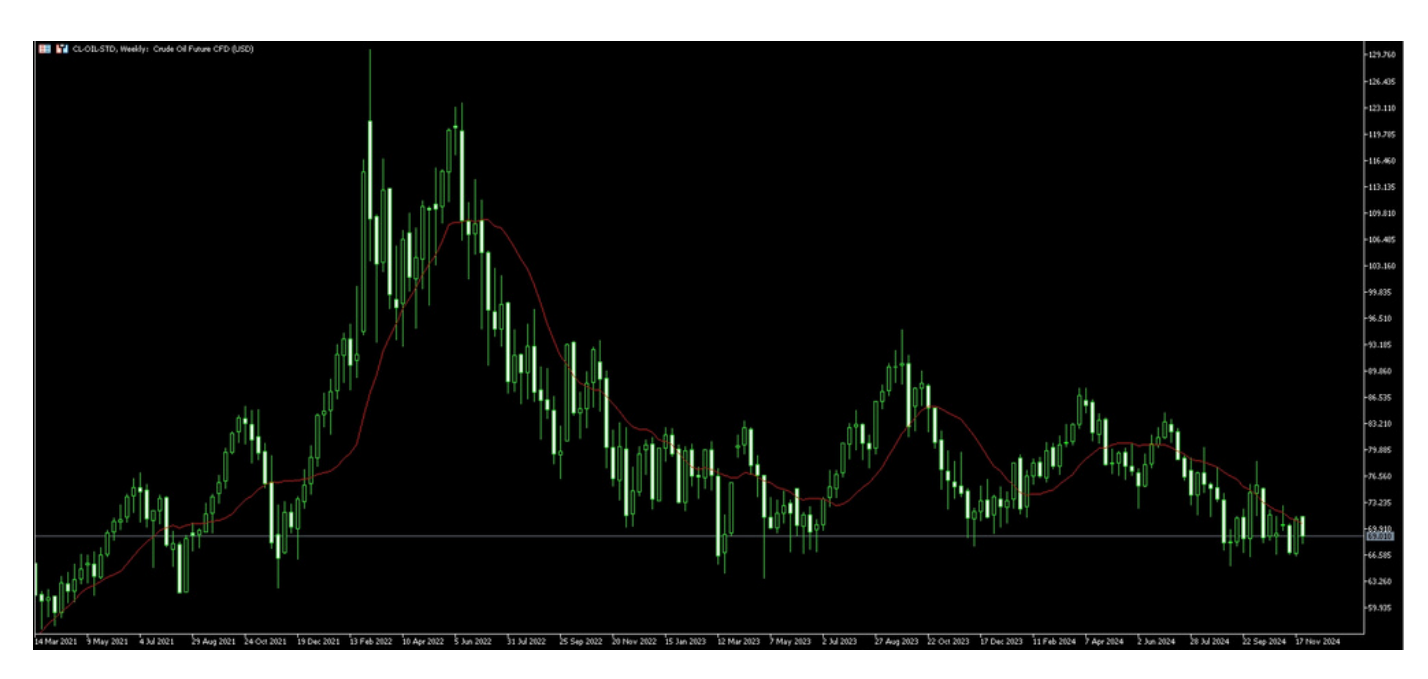
Figure 4: Crude Oil Weekly Chart

As previously mentioned, the ongoing crisis in the Middle East will continue to affect Oil and can lead to price volatility, which can bring about risks that traders should be prepared for.